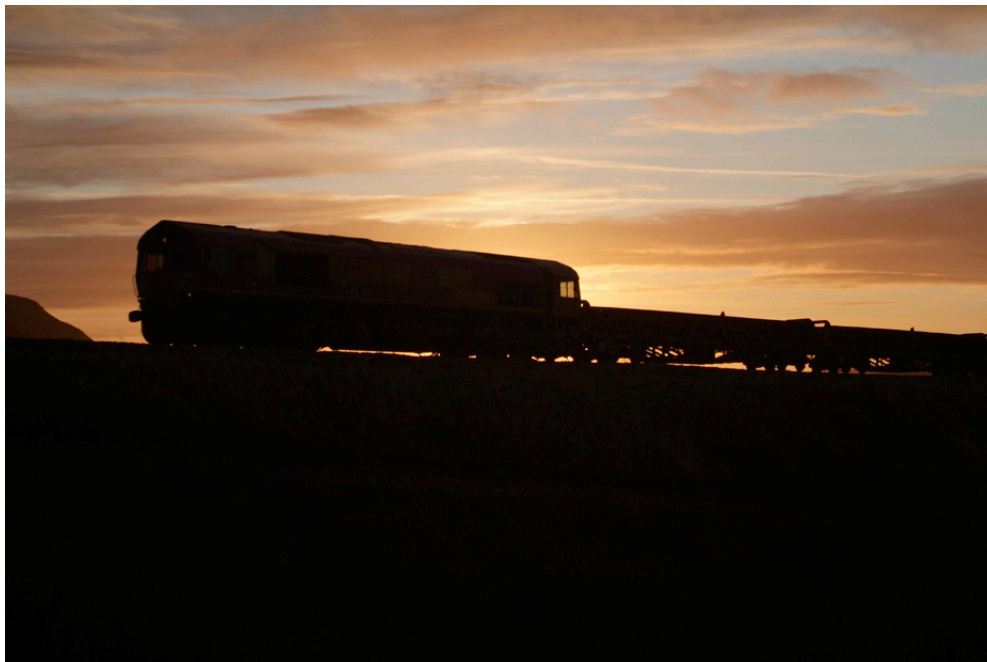
Above: He had to get up early for this one! 66016 silhouetted against the sunrise near Lunds at 08.02 with the 6L92 Blackburn - Carlisle on 19th October 2011.