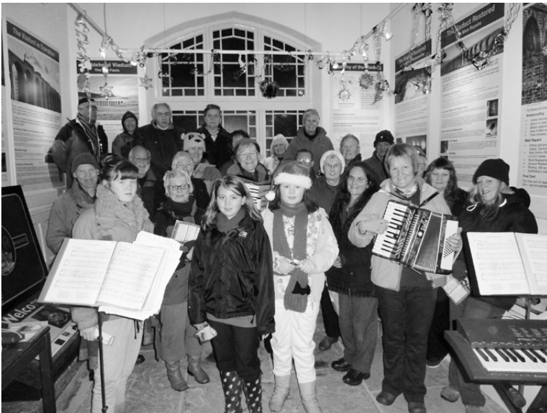
Visitors to the Ribbleshead carol service well wrapped up against the cold in what was the Booking Hall of Ribbleshead station.

Future Events: FoSCL have now booked a stand at Railfest which is a big celebration of Britain's railways. This is being