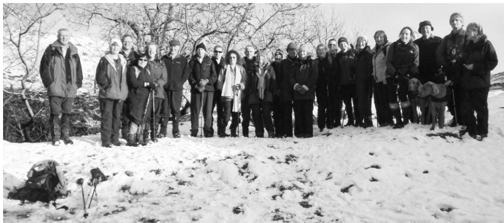
The group who did the walk before heading off to the Hart's Head at Giggleswick for the walkers's Christmas meal on 17 December 2011.