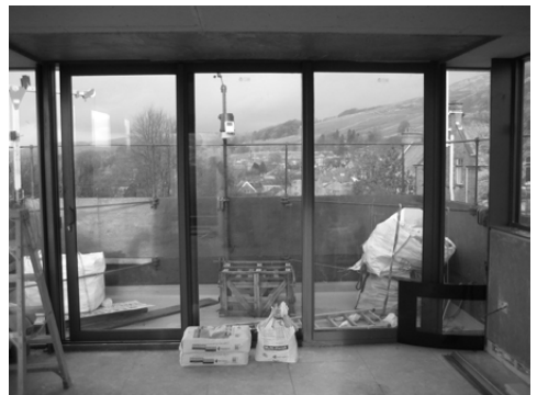
Work in progress in the tank looking towards FoSCL's weather station.